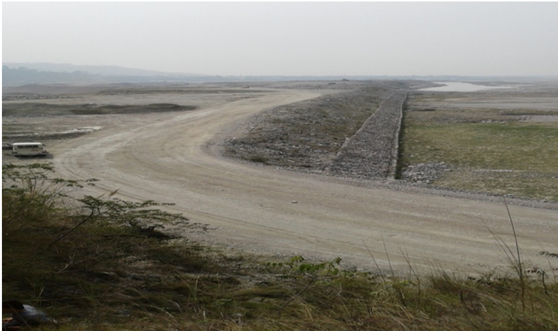
River Training Works at Amochu